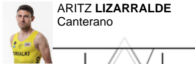
ARITZ LIZARRALDE Canterano