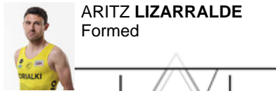
ARITZ LIZARRALDE Formed