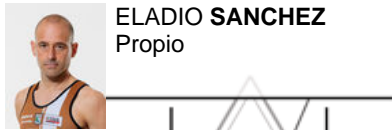
ELADIO SANCHEZ Propio