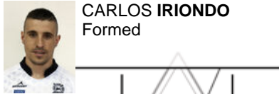
CARLOS IRIONDO Formed