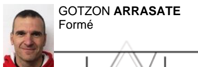
GOTZON ARRASATE Formé