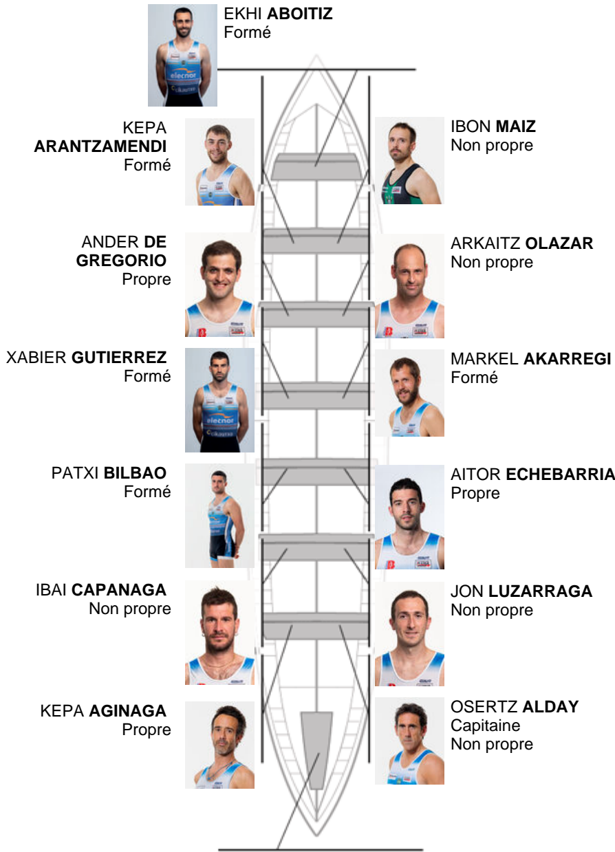
IÑAKI GOIKOETXEA Formé