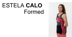
ESTELA CALO Formed