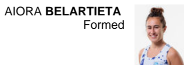
AIORA BELARTIETA Formed