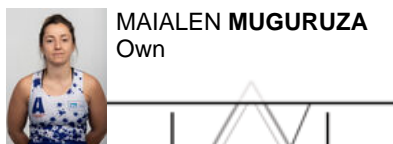
MAIALEN MUGURUZA Own